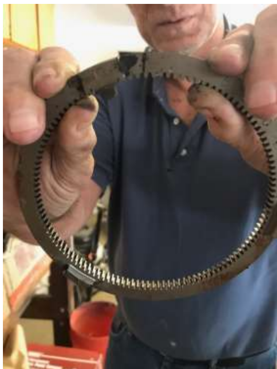
Cracked Ring Gear