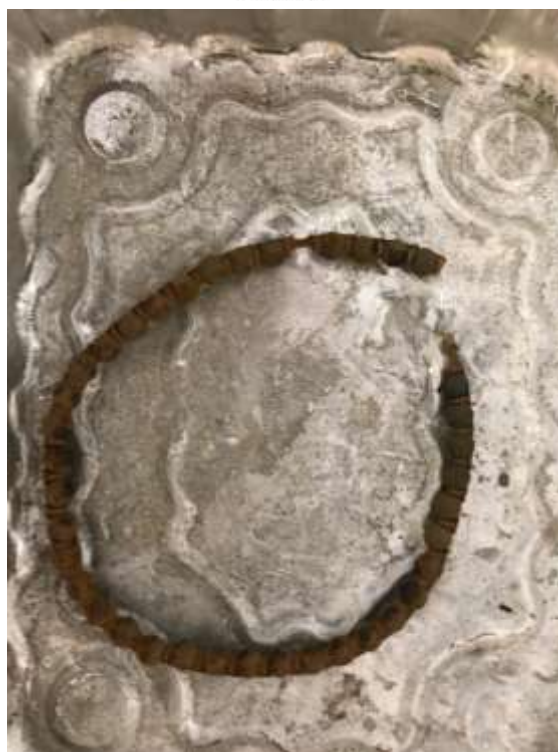
Lower bearing race is NASTY!