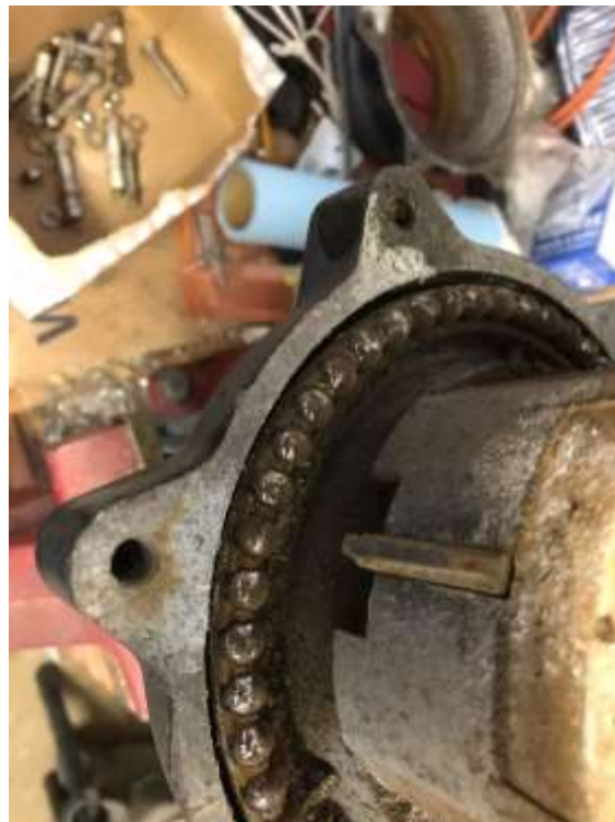
Middle race can be cleaned and greased.