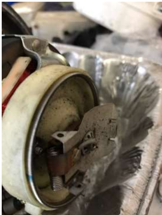
Pin came out of indicator pot. The pot also needs replacement.