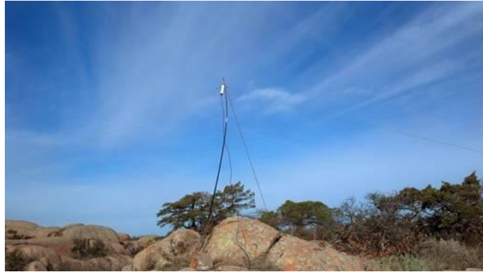
(above) Elk Mountain and Mount Scott (below)